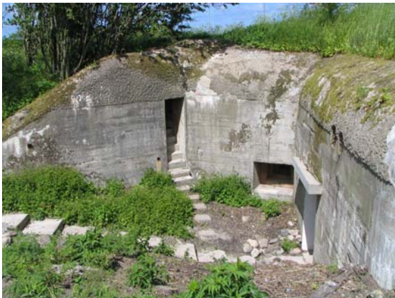
The entrance in Frederikshavn