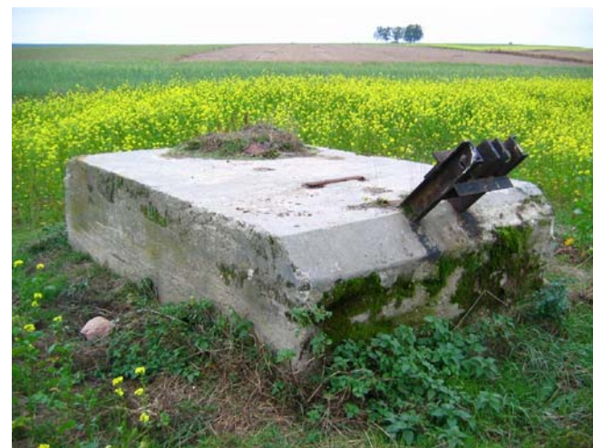
Anchor block, identical to that of M I/II.